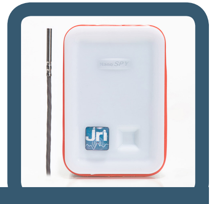
Non contractual photo

Mini Extreme Temperature Data logger 2,4GHz radiofrequency communication